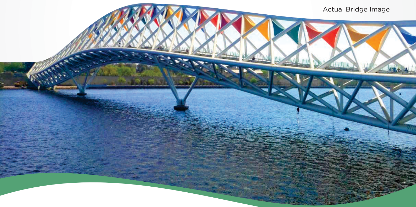
Actual Bridge Image

The main structure of this Engineering Marvel is executed. Its design and its vibrant colors will be an exceptional feature of this quintessential Bridge. The task of Tensile Fabric, SS Railing with Glass and Granite Flooring work is under development. Base work of Wooden Flooring is also underway.